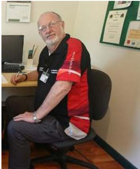
JP Signing Support Commissioner for

This program is a wonderful soft entry point to learn about other Community Centre programs and services