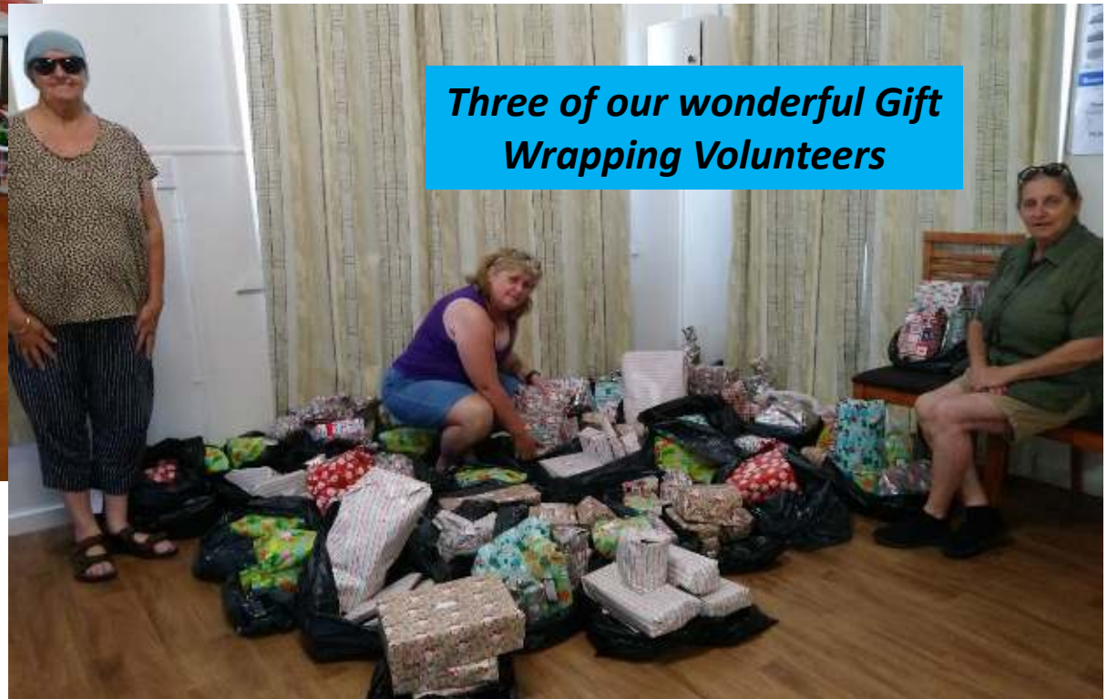
Three of our wonderful Gift Wrapping Volunteers