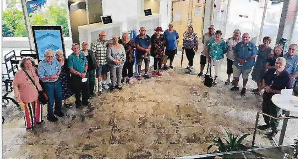
The Rosewood History Group took a tour of the Rosewood Library.