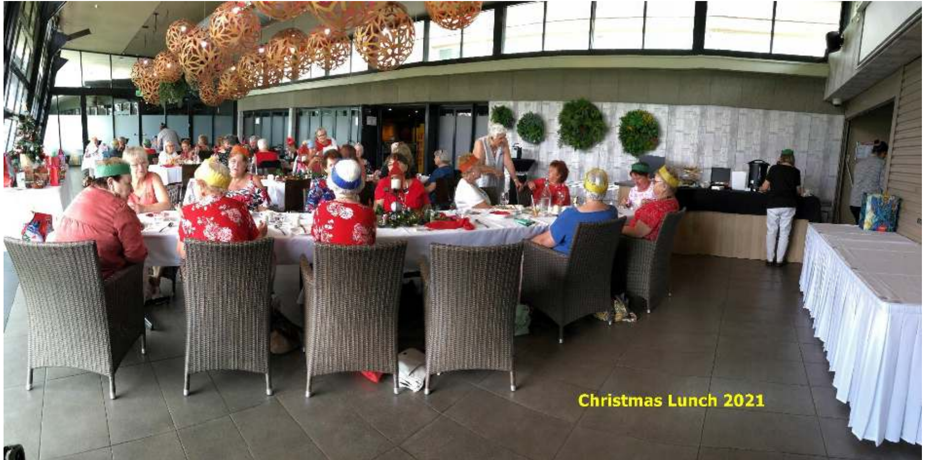
Christmas Lunch 2021