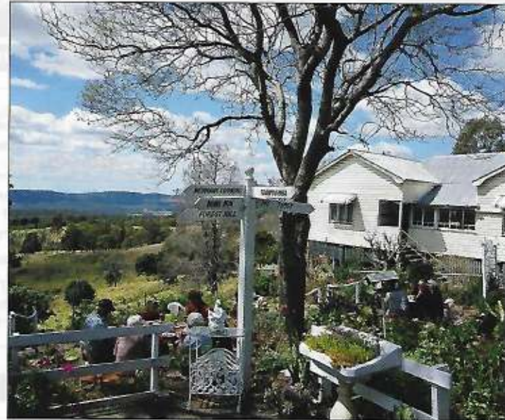
The Rosewood Seniors Group enjoyed an outing to the Toowoomba Carnival of Flowers.