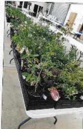
An array of native plants will be on sale at the Rosewood Native Plant Sale and Environmental Day.

"We do encourage everyone to bring along their own bags or boxes as well as an open mind as there will be many