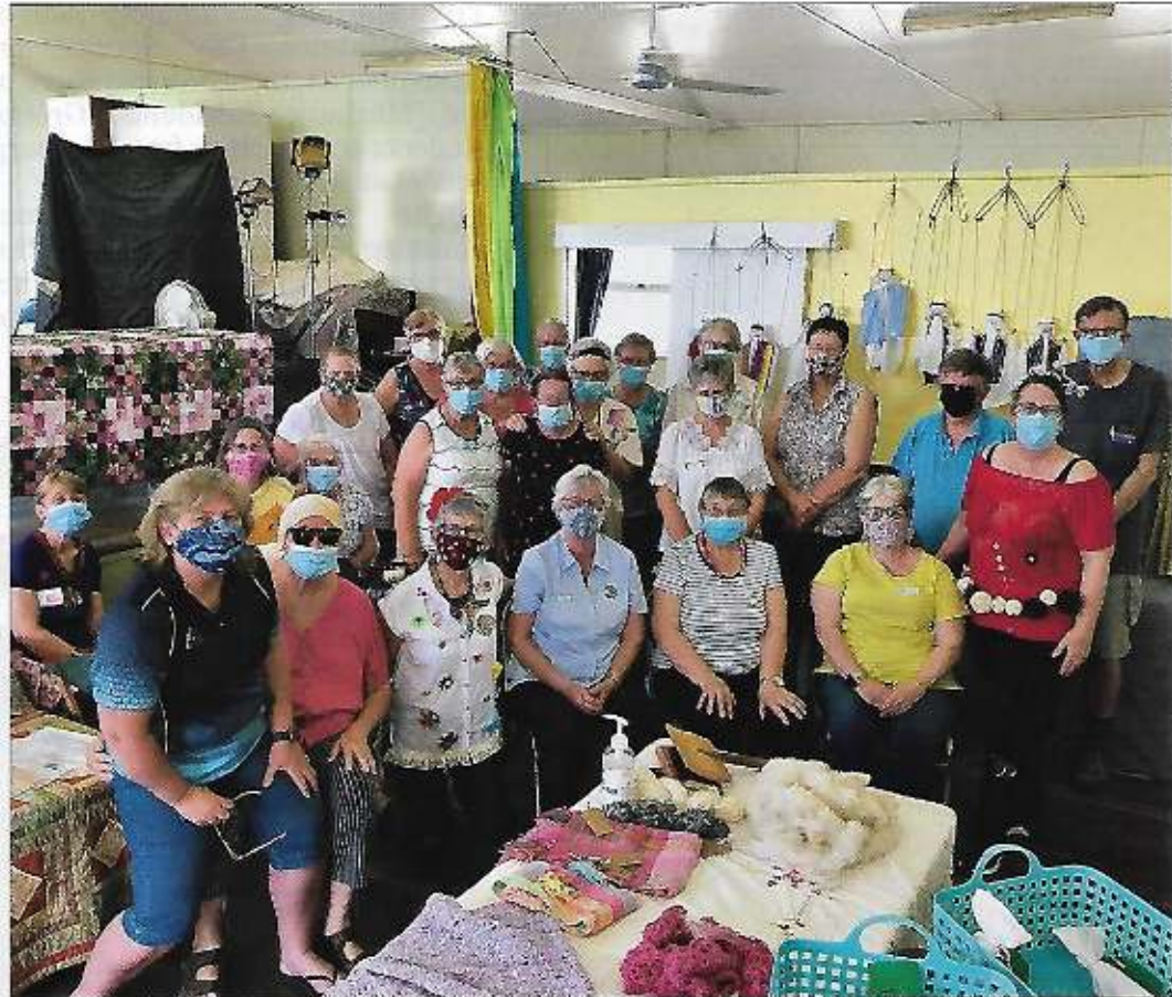
The Rosewood Community Centre host a creative art display to raise money for the Rosewood Uniting Church.