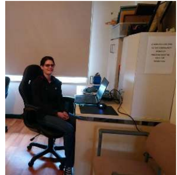
Thurs 9am to 12md. outside these hours.

This program is a wonderful soft entry point to learn about other Community Centre programs and services