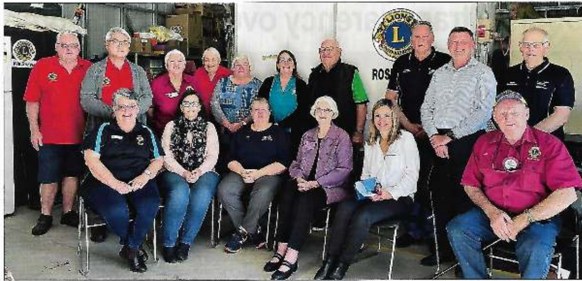
The Rosewood Lions presented donations to groups and organisations.