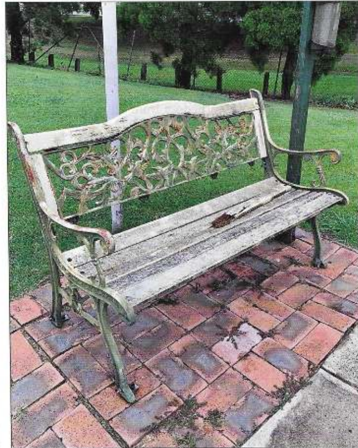
A chair in Cabanda before its restoration.

"It is like a whole new chair, safe, sturdy and definitely a feature in the grounds."